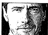
BEPPI CROSARIAL WINES AND SPIRITS

B ordeaux. These days, the word could be French for "hard sell." The world's most famous wine region — and still its most important, in a declining-empire sort of way — is hurting. As you may have read in this newspaper earlier in the week, hundreds of chateaux are on the verge of bankruptcy. Growers are being paid by the European Union and the local growers' association to cut supply by pulling out their vines.